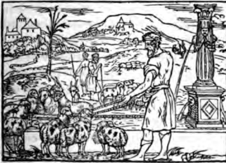
Gene. xxx. and xxxi.

Thou shalte not desire thy neyghbours house, wyfe, man seruaunt, woman seruaunte, oxe, asse, nor anye thynge that is his.